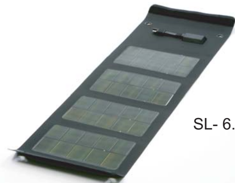
SL- 6.5 Watt